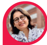
Priyanka Gandhi Vice President